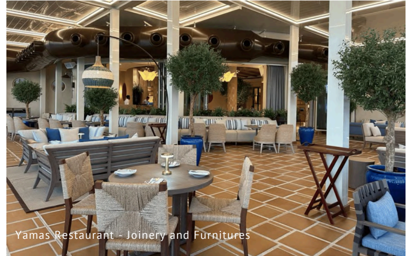
Yamas Restaurant - Joinery and Furnitures