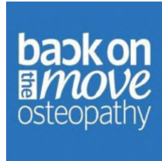
Back on the move Osteopathy