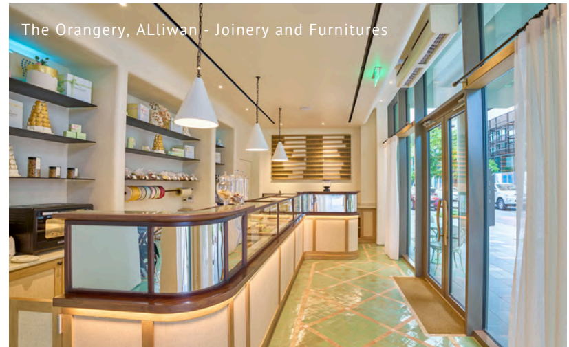
The Orangery, ALLiwan - Joinery and Furnitures