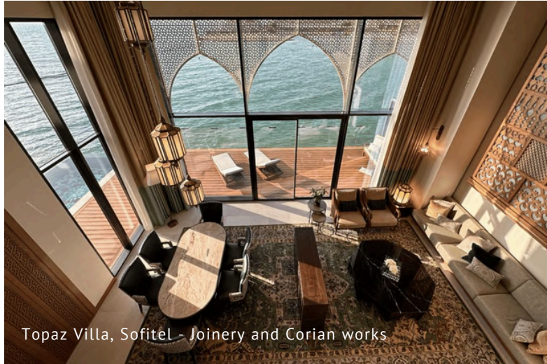
Topaz Villa, Sofitel - Joinery and Corian works