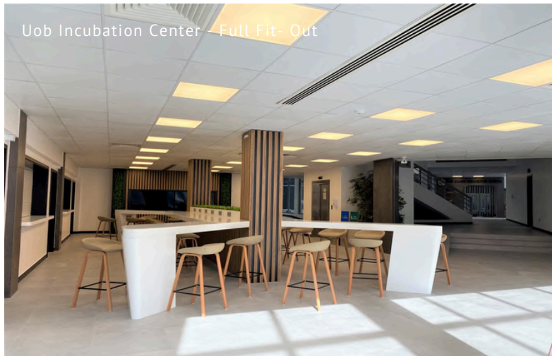
Uob Incubation Center - Full Fit- Out